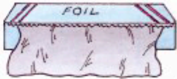
heavy-duty aluminum foil