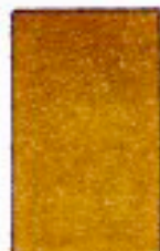
construction paper in skin color of your choice