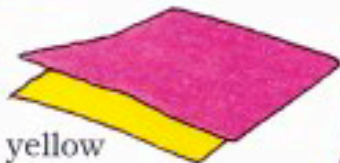
pink and yellow construction paper