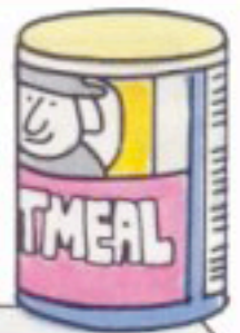
Empty, round oatmeal carton