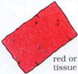
red or green tissue paper