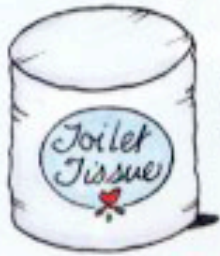
wrapped single roll of toilet tissue