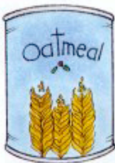
large oatmeal box